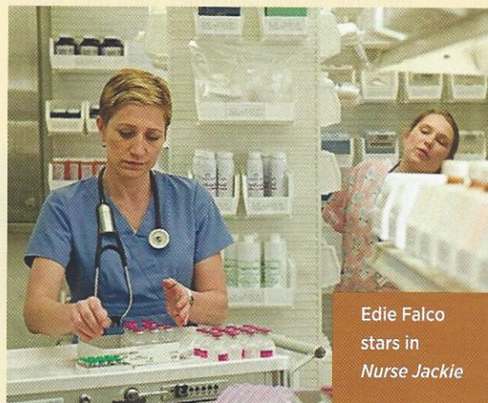
Edie Falco stars in Nurse Jackie

Harmful stereotypes continue to undermine nursing's media image. In the vast majority of recent television depictions, nurses are unskilled handmaidens, while physicians deliver all the nursing care that matters: