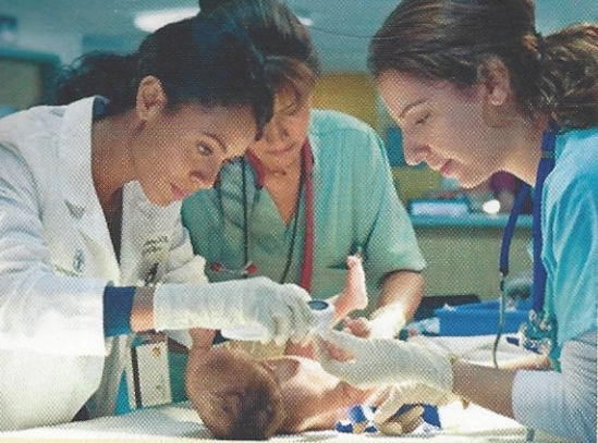
image has played a role in some of the television advertising in Johnson & Johnson's Campaign for Nursing's Future. And though the naughty nurse rarely appears in television dramas today, she remains a staple of global advertising and, of course, pornography.

These stereotypes matter because they drive the undervaluation of nursing that underlies the current nursing crisis, including more immediate factors like short-staffing. If decision-makers and the public valued nursing as a modern science and profession whose practitioners save lives and improve patient outcomes, then they would be far more likely to allocate the clinical, educational, and research resources nurses need to save lives.